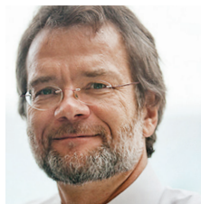
Alexander Seger Council of Europe