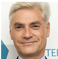
Bertrand de la Chapelle Internet & Jurisdiction Project